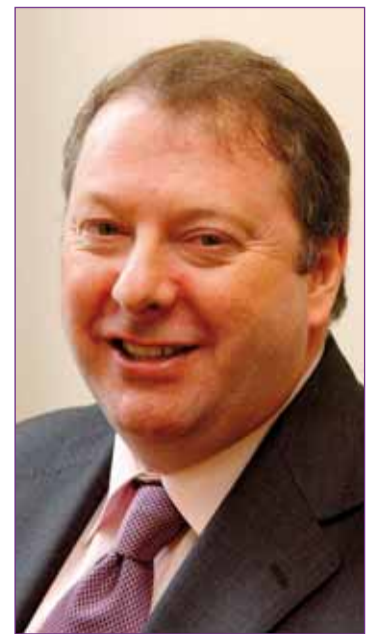
Kevin McLaughlin, NIHRC Commissioner

completed and the United Nations have now adopted the new Convention on the Rights of Disabled People. This means that the rights of the 600 million disabled people throughout the world will now be recognised in law and that countries will need to work on incorporating those rights into their own domestic legislation.