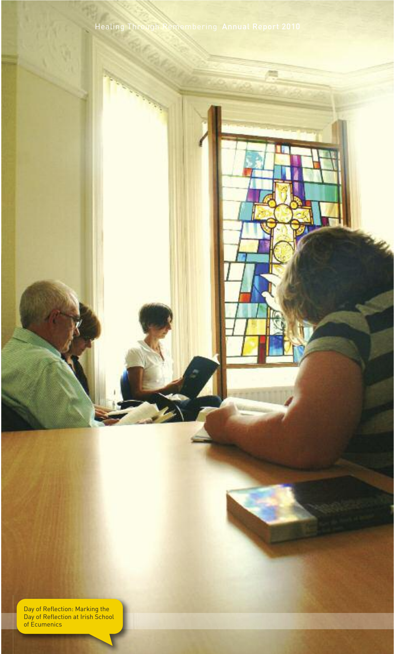
Day of Reflection: Marking the Day of Reflection at Irish School of Ecumenics