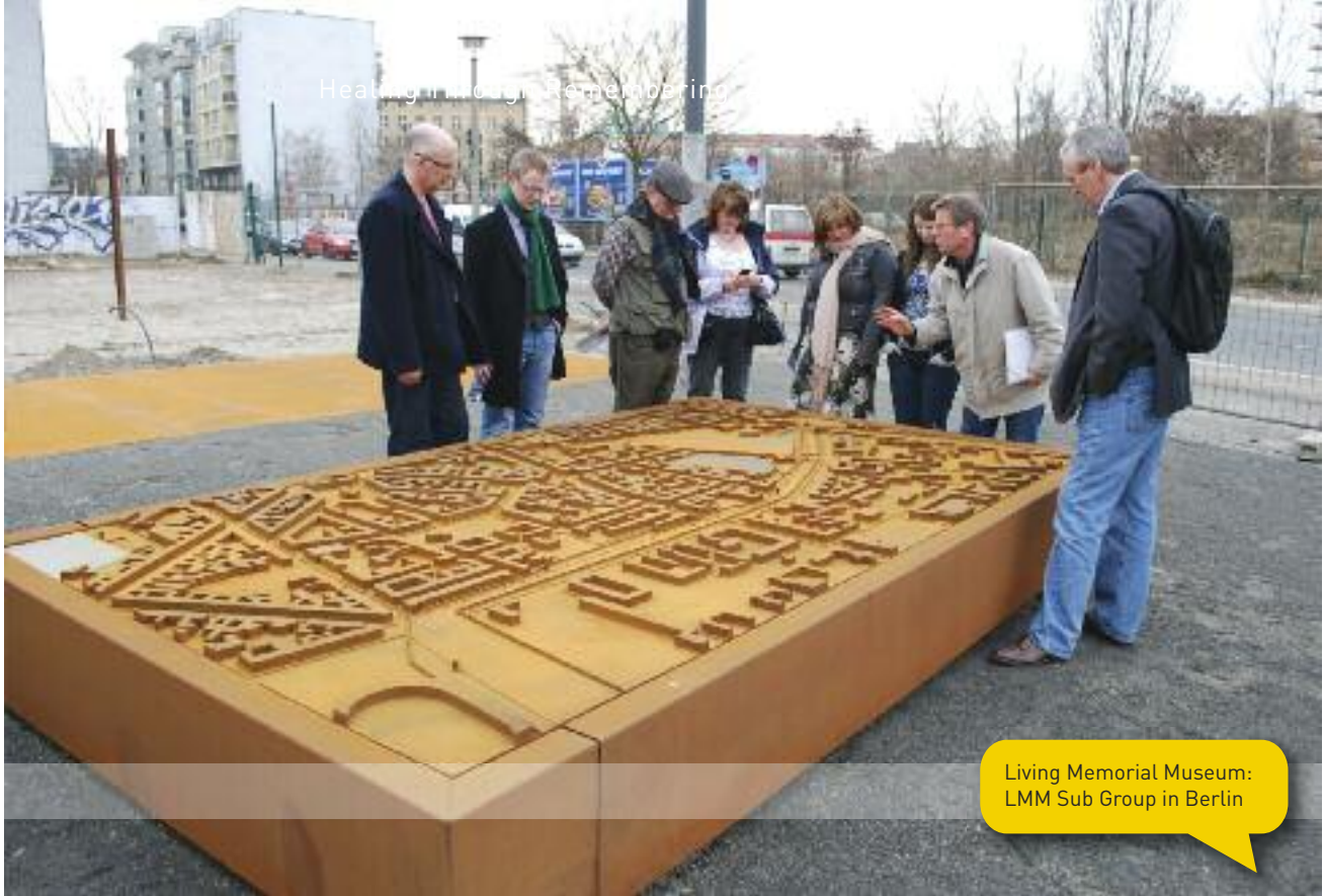
Living Memorial Museum: LMM Sub Group in Berlin