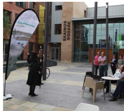
Public pop-up street theatre productions were performed throughout Belfast, including (from L to R, top) outside the Spectrum Centre on the Shankill Road, on the grounds of Belfast City Hall, outside the Linen Hall Library, (from L to R, bottom), Fountain Street, Cornmarket, and Skainos Café on Lower Newtownards Road.